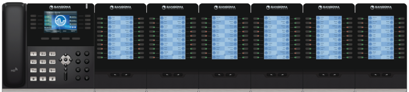
Daisy-chain Up to 6 Modules

The EXP100 is managed and provisioned by the Sangoma s500 and s700 IP Phones which means they can be auto-provisioned efficiently via Zero Touch Provisioning and the FreePBX / PBXact EndPoint Manager.